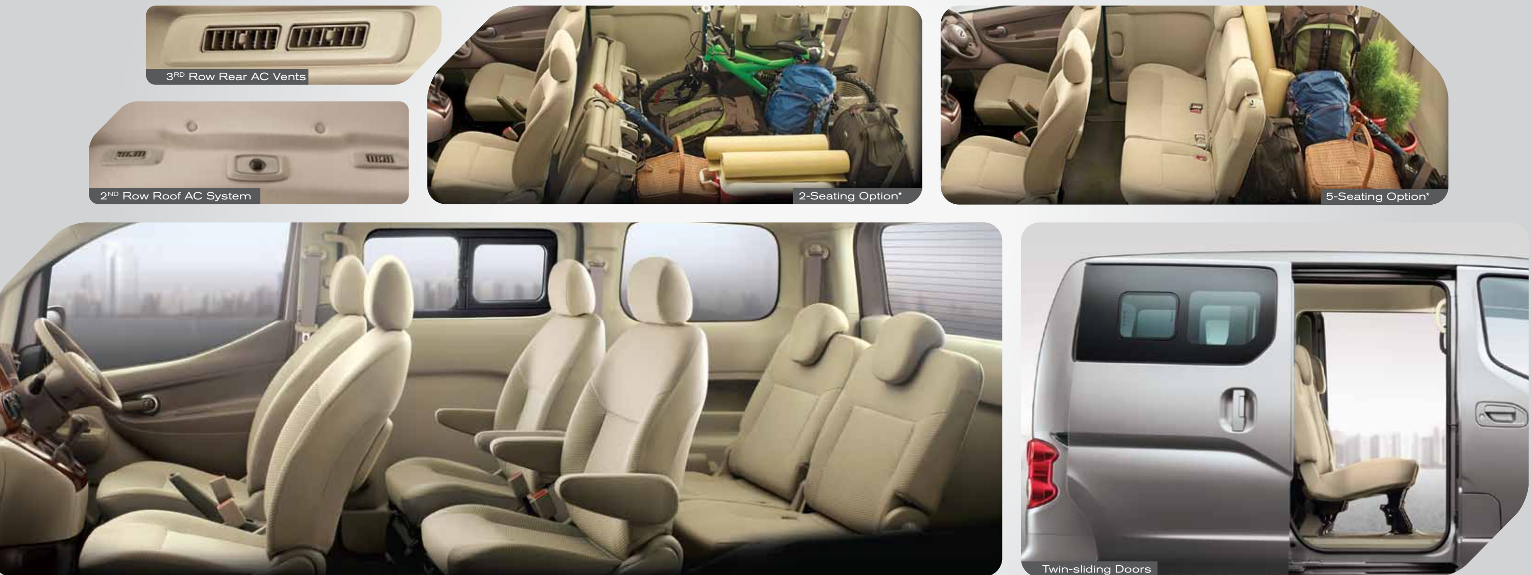
*Select between the bench and captain seats.

The Evalia is a comfortable lounge for your family with features to enhance your driving experience, like an integrated air-conditioning system and comfortable reclining seats. In addition, remarkable legroom and unobtrusive storage spaces are a part of the reasons the Evalia is in luxury status. Moreover, the 15" wheels in combination with the leaf-spring setup makes for a composed ride.